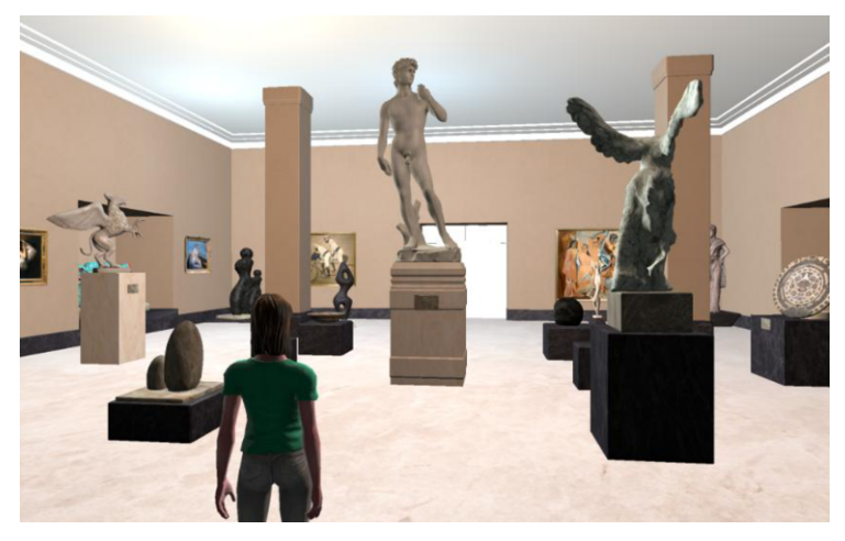
Figure 2. A screenshot of the virtual gallery in REVERIE.

The second educational scenario is a virtual gallery with 3D reconstructed objects (see Figure 2) representing various historical eras. This scenario is a virtual gallery competition, where students have to search the virtual gallery, find objects assigned by the teacher and talk about them with the aim to convince their fellow students and teacher about the importance of the object. Specifically, once they are all in the virtual gallery, the teacher shares with each student a card containing information and a number of questions to consider in their presentations (e.g., when was the object made, why is it important?) about a random object in the gallery. The student has to walk around the world, closely observe the exhibits in order to find the object. Once the student finds the object, s/he needs to guide the rest of the group by providing navigation instructions using the spatial audio features around the object so the presentation can begin. Once the student is ready, s/he must enter the name of the object on the REVERIE GUI and start presenting.