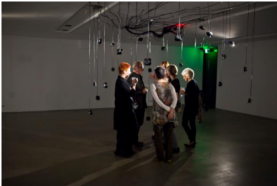
Fig. 2. EEG Sonification, Shona Illingworth, UNSW, 2014. Supported by The Wellcome Trust.

The visual matrix focused on a particular experimental work-in-progress within the exhibition—a sound installation based on an electroencephalogram (EEG) measuring activity in Claire’s brain. This comprised 32 speakers suspended in cranial formation corresponding to electrodes on Claire’s skull during the EEG, emitting electronic sounds (Fig. 2).