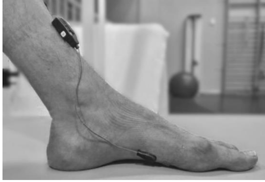
Figure 1. Trigno Mini wireless sensor placed on the foot for abductor hallucis muscle.