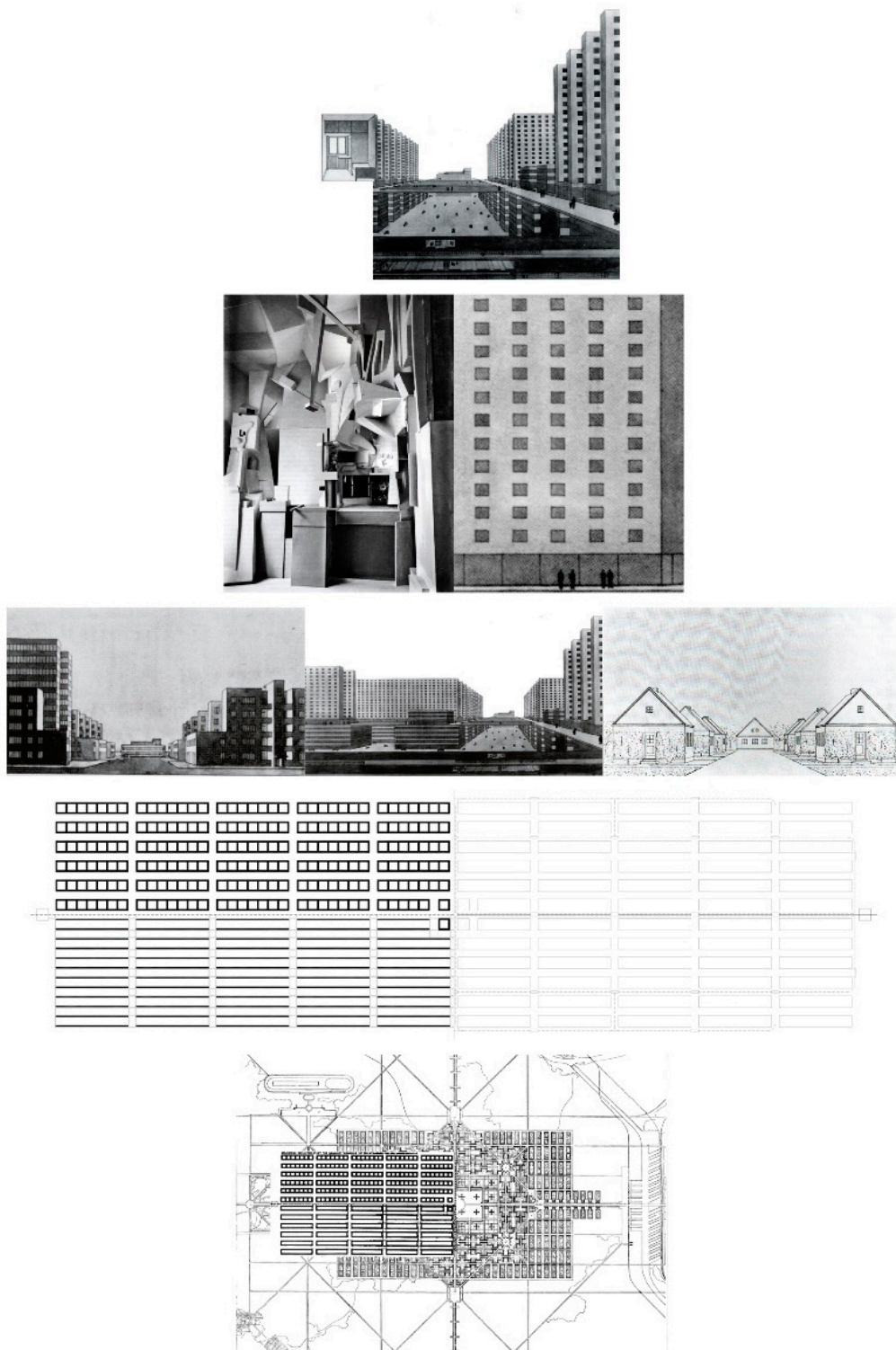
Figure 1. Montage panel by author. While art avant-gardes represented the intensity of the city through collage and assemblage of multifarious elements, Hilberseimer sought to internalise the shock of the metropolis and distilled the “nervous energy” into a language of formally reduced elements and typical forms that could be produced and reproduced in generic schema—an architectural analogue (or analogical form) of Georg Simmel’s blasé attitude.