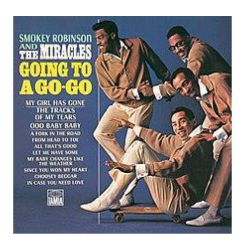
(Fig. 1 The Miracles – Going to a Go-Go)

Accounts suggest that the go-go style of dancing emerged simultaneously in two American night clubs: The Peppermint Lounge in New York City and a Los Angeles venue, The Whisky a Go-Go. At The Peppermint Lounge the dance evolved from women performing The Twist, another 1960s dance on tables, until gradually their movements became the go-go style ( The Twist , 1992). The Whisky a Go-Go which took its name from the fashion for go-go dancing, was immortalized by The Miracles in the 1966 song Going to a Go Go , an inclusive anthem describing the mood of the dance clubs (See Fig. 1) (Hunt, 2009).