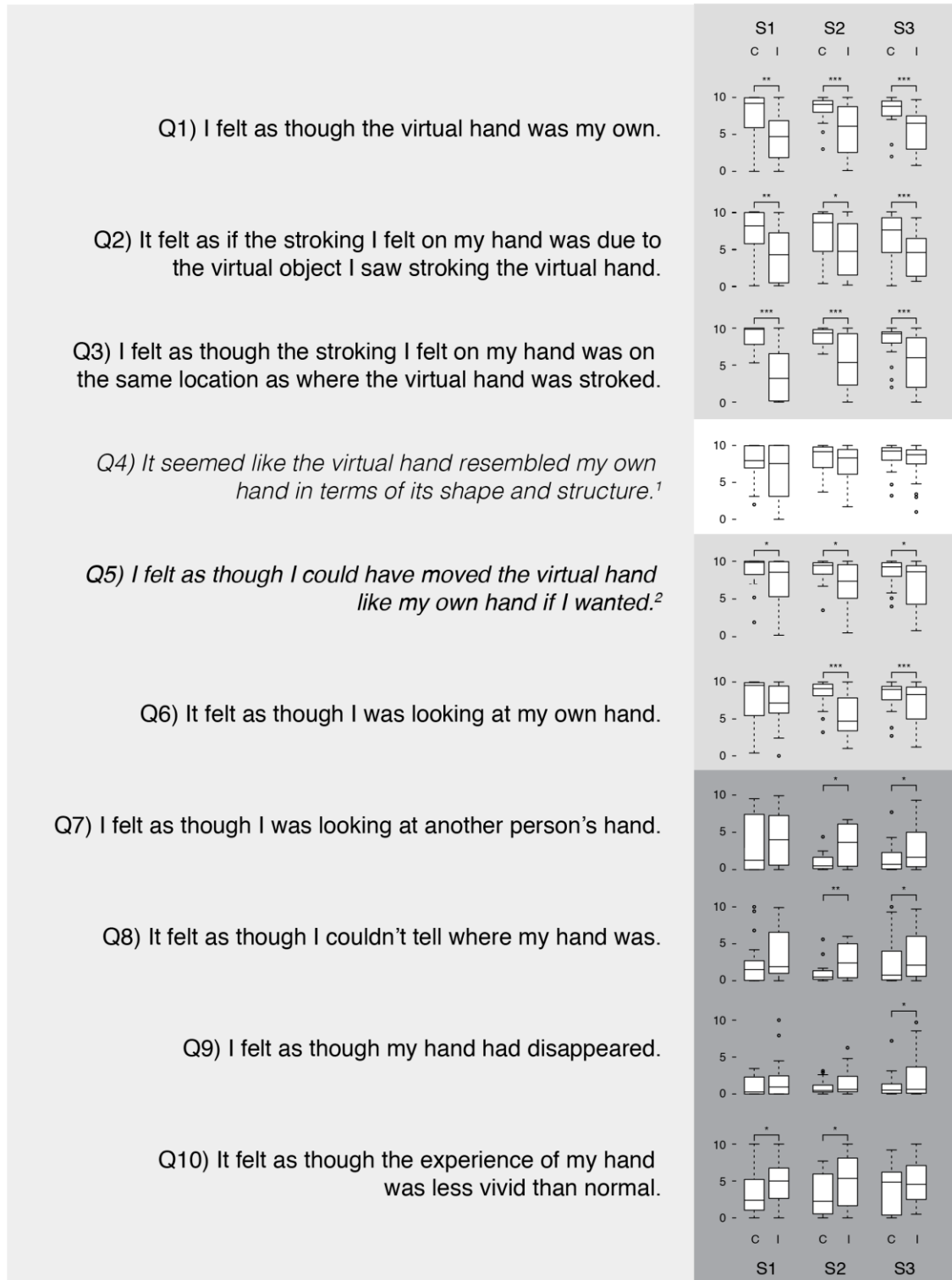
Figure 2 – Questions and box plot with interquartile ranges of the results across the three studies (C-Control, I-Illusion) – Questions 1 through 6 were adapted from previous studies on the RHI. Question 4 is a control question and question 5 addresses participants' sense of agency. Questions 7 through 10 were included to directly address disownership aspects of the ReHI. Participants in all three cohorts rated embodiment higher given synchronous visuotactile feedback about their upper limb in the control condition compared to the asynchronous feedback during the ReHI. All asterisks indicate NHST significance. Data for S2 and S3 (sham stimulation) are taken from left hand.