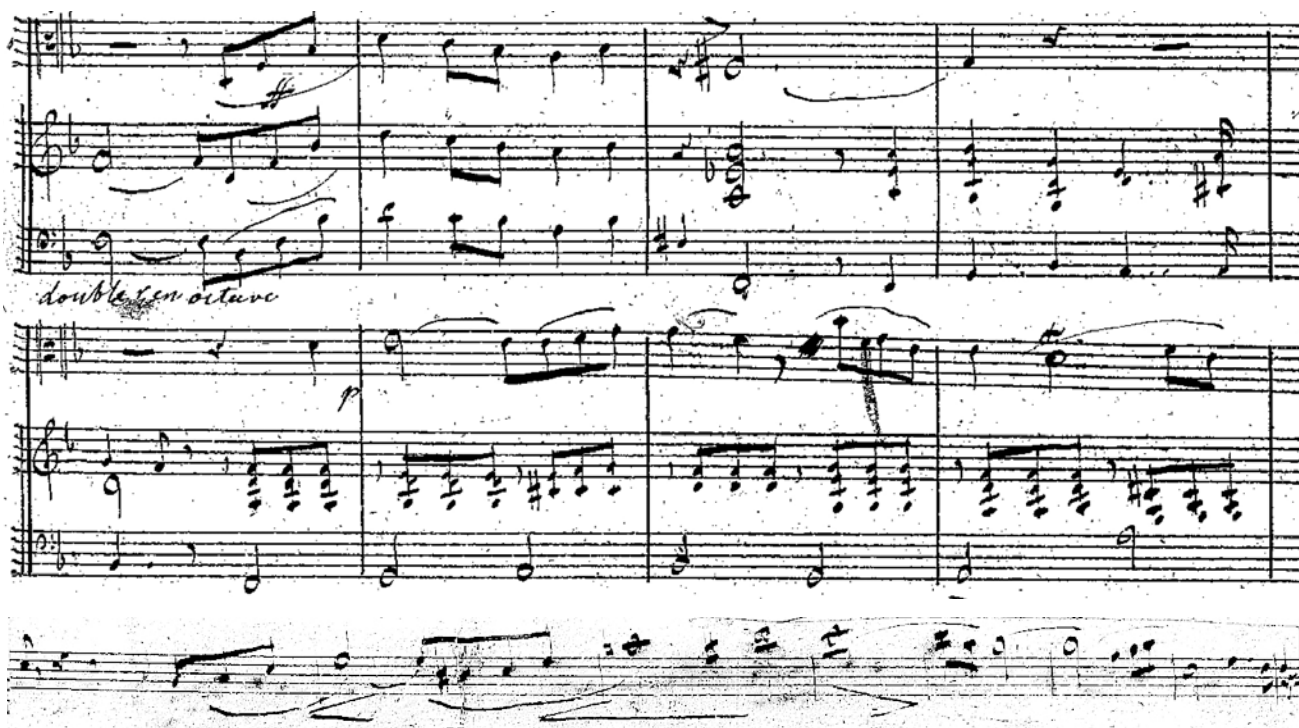
Illus. 3: First manuscript, mm. 33–40 and its new version in the second manuscript (third line).