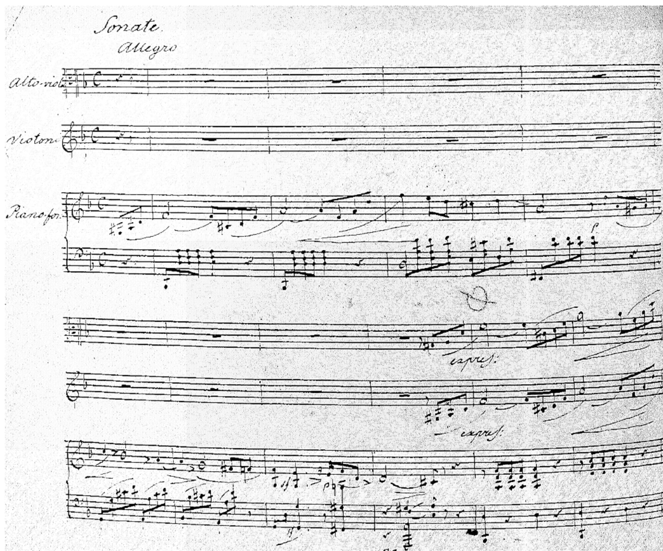
Illus. 4(b). The opening from the third manuscript.

likely that the last pages were simply lost as possibly were the last pages of the first manuscript.