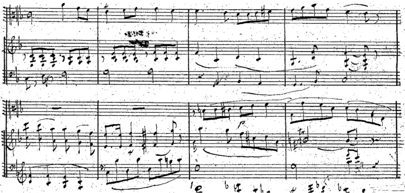
Illus. 6. Second subject, first manuscript, pages 3-4.