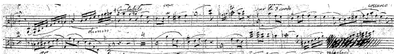
Illus. 5. Second subject, second manuscript.