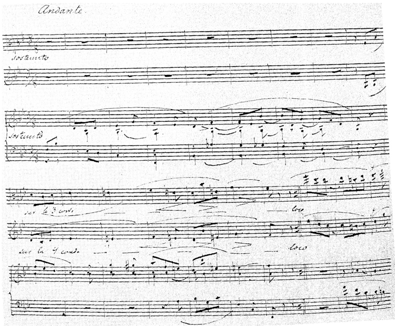
Illus. 9(a): opening measures, third manuscript/first manuscript.

The recapitulation also had only minor alterations in the second and third manuscripts. (See Illustration 8.)