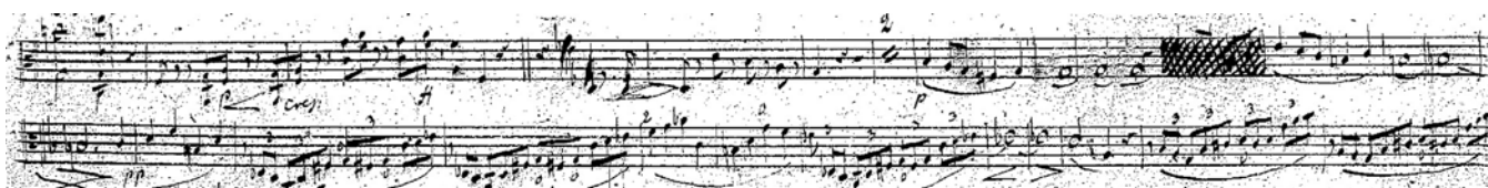
Illus. 7: Development, second manuscript, page 1, lines 10-11.

moderato , but the third has only Allegro . Borisovsky kept the tempo indication of the third manuscript. The elegance and eloquence of the main subject of the first movement in D minor, which at first starts in the piano part, was a work in progress for the composer, as his initial version differs from his final choice. (See Illustration 4.)