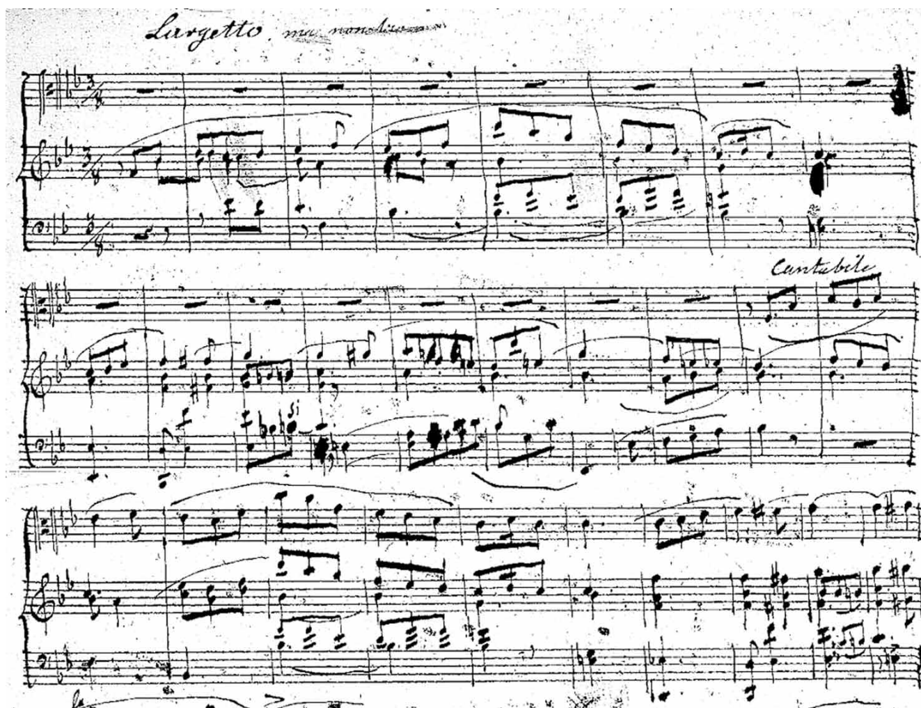
Illus. 9(b): opening measures, third manuscript/first manuscript.

This arrangement has proved to be reasonably effective, as it gives a better development to the melodic line in the viola part and therefore avoids unnecessary repetitiveness. (See Illustration 10.)