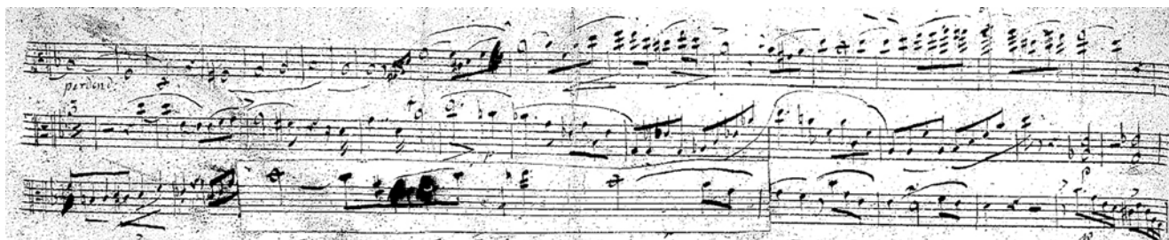
Illus. 8: Recapitulation, second manuscript, page 2, lines 1–3.