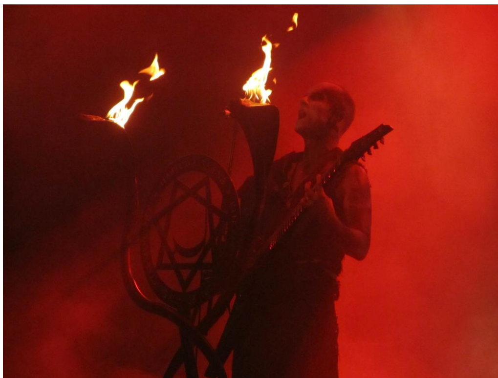
Image 1 Behemoth, Bloodstock festival, 2012, Catton Hall, Derbyshire

music is the object of interest itself. It is both the expression and the essence of the culture. The Californian heavy metal band Machine Head express this well in their lyric in the song Darkness Within : “So pray to music build a shrine/Listen in these desperate times/Fill your heart with every note/Cherish it and cast afloat/ Because god is in these clef and tone/Salvation is found alone/Haunted by its melody/Music it will set you free/Let it set you free” (Flynn, R. 2011). The Polish blackened death metal group Behemoth have recently explored heavy metal in arguably a worshipful sense in their works Evangelion (2012) and The Satanist (2014), their lyrics building on research into Biblical and Gnostic texts as well as the works of Georges Bataille and Friedrich Nietzsche. They present a Dionysian inversion of Christian liturgical worship, embellishing on themes of the negative and the absent. The stage performance of Behemoth extends the worshipful nature as a parody, in its use of a pulpit-like stand behind which the singer, Nergal Darski pronounces his orations to the amassed crowd (see image below).