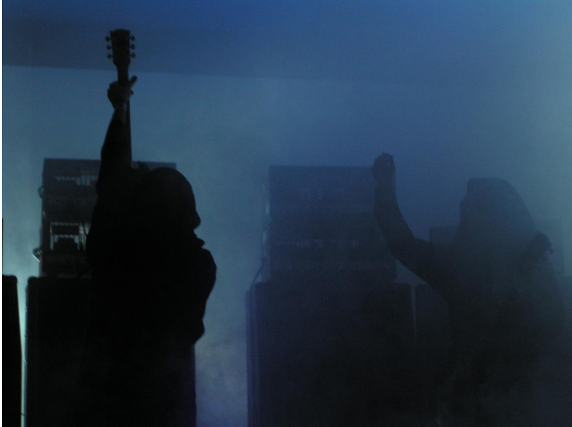
Image 5 SunnO))) Supersonic Festival, Birmingham 2009, image: © Niall Scott

to such a degree that some leave the performance space physically not able to deal with the noise.