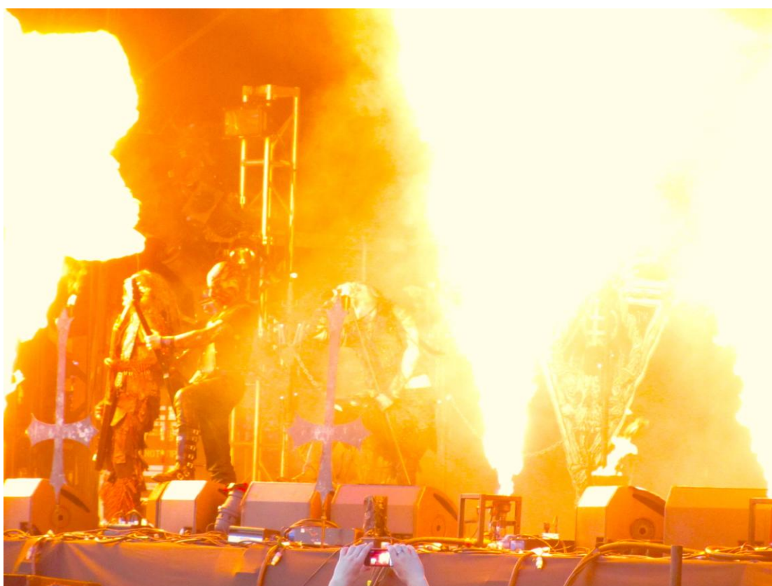
Image 4 Capturing a moment: More than just a spectacle? Watain, Bloodstock festival Catton hall, Derbyshire