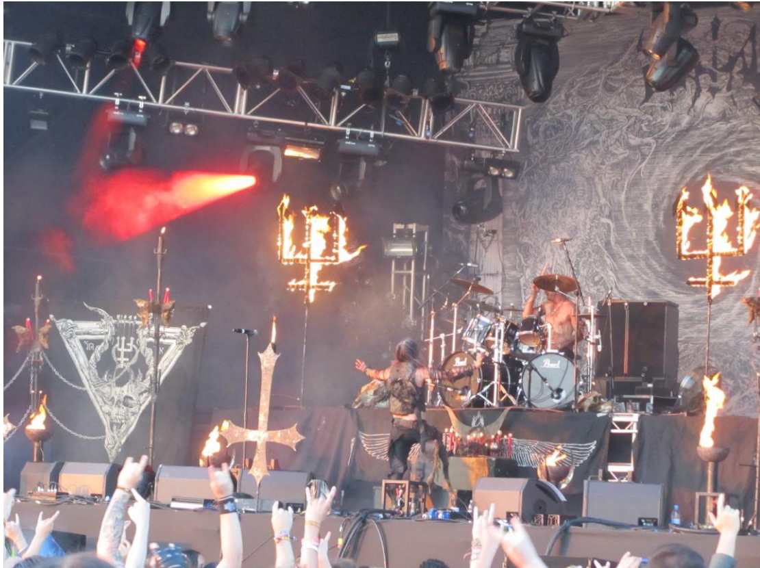
Image 3 Watain Bloodstock festival, 2012, Catton Hall, Derbyshire, image © Niall Scott

Once the music begins, for the most part there is no room for silence, but with continuous sound (as is also the case with drone metal) it is the recognition and memory of silence that allows one to make sense of the experience. One is confronted by a totality of noise, made comprehensible by a totality of silence. Words are putrefied to growls and slaughtered; as is the word of God: "For I am the one to bring the demise of the bearer of thorns" (Danielsson, 2000).