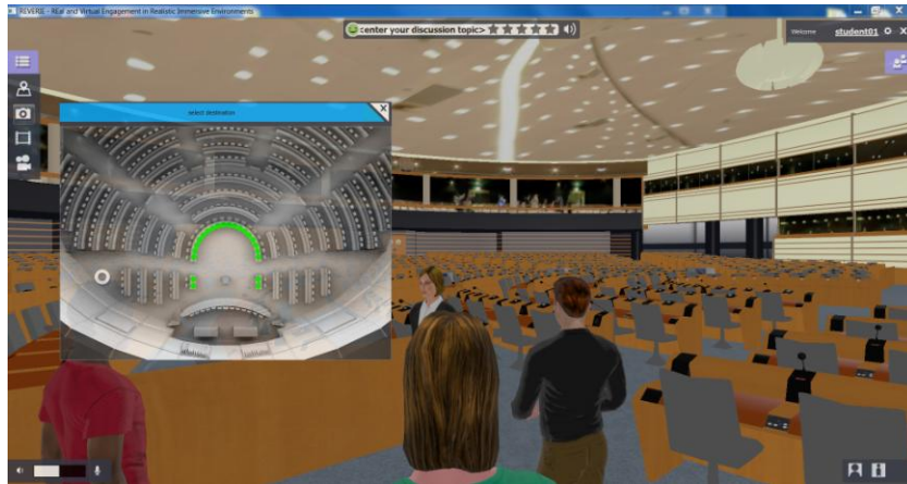
Figure 1: The REVERIE's Virtual Parliament educational scenario

We used the REVERIE framework (Fechteler et al., 2013) to implement an educational scenario which immersed participants in a guided tour of the virtual European Union (EU) parliament followed by an online debate session. In this role-playing scenario participants (in the role of teachers or students) interacted with each other and an Embodied Conversational Agent (ECA) to complete educational tasks designed to promote dialogic learning (Hajhosseiny, 2012).