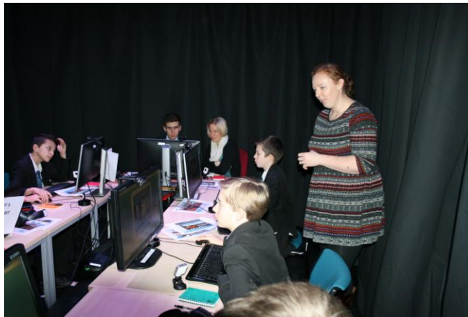
Fig. 3. One of the evaluation sessions in the laboratory

Four REVERIE researchers were present in the lab to record each session and to provide the necessary support (technical and logistical) for the successful completion of each session.