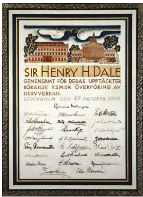
Figure 3. The Nobel Prize certificate awarded to Henry Dale in 1936.