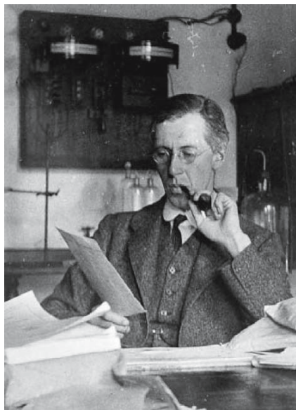
Figure 1. A photograph of Henry Dale taken in 1918 at the Lister Institute for Preventive Medicine.