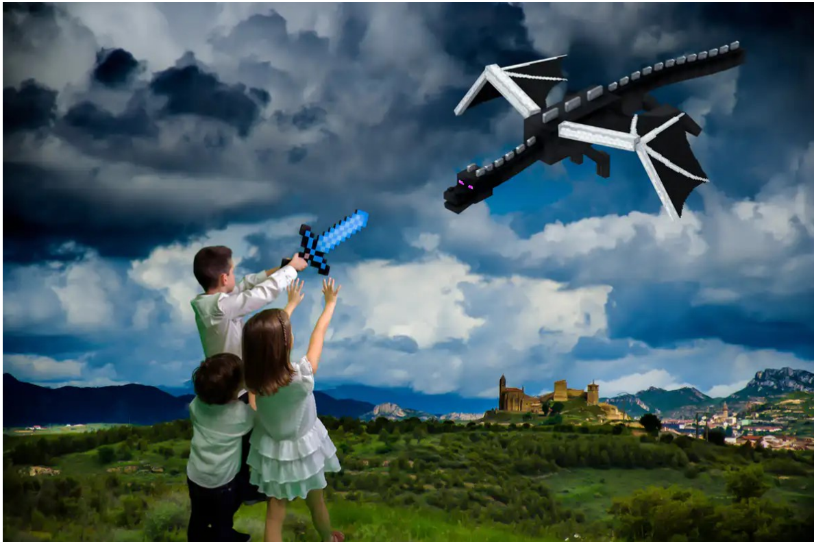
Gaming can take you out of yourself and lets you enter new worlds.

“At-risk” language learners, by Gee’s definition, could be anyone. They may be learners with special educational needs, but equally they may also simply be learners who feel more vulnerable in a language classroom. Learning a language, after all, is a huge departure from some students’ comfort zones. Students, for example, can get nervous and inhibited in a classroom. Language learning researchers describe this as an “affective filter” – a fear of making a mistake and losing face literally affects how far a student joins in the class.