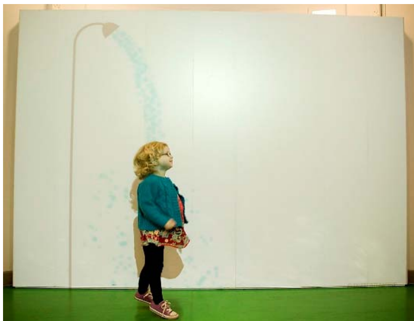
Three Drops by Scott Snibbe

Within the same programme Three Drops by Scott Snibbe has been installed at Picton Neighbourhood Health Centre (pictured below). Here people's presence and movement triggers the animation on the screen when people walk in front of the projection. The work is split into three sections which all play with the idea of water; a shower of water pours over a user; a single drop of water is hugely magnified and can be played with like soft beach ball; and water is magnified to large molecules which can also be played with. The piece is set within a children's play area and is said to have an impact on the children's experience in the centre. Overall, the programme aims to create spaces that offer interest and distraction from the task of waiting for appointments. There are five projects in this programme each in a different health centre. In the first two projects the works were commissioned after the buildings had been completed and artists were asked to produce something in relation to the spaces. In the later three examples the commissions were developed alongside the overall design of the space.