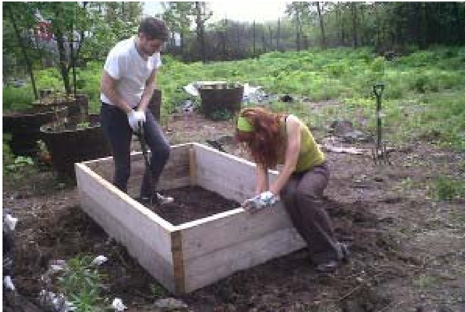
Allotments in Glasgow's East End

The CCA's ability to sustain long-term projects is impaired by staffing pressures. Due to funding limits the gardening projects have been supported by interns rather than permanent members of staff. Many interns are on three month placements. Although digging, weeding and gardening have not always felt much like art for the interns, this is not their main issue or concern. Rather, it is the limited possibility of seeing through development in programmes that are only likely to produce change over a five to ten year period.