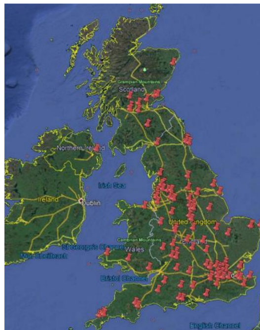
Figure 1 Geographical location of survey respondents (n=154). Each pin represents a single postcode (first three or four digits).

One hundred and fifty-six people completed the two mandatory questions (confirming that they were an occupational or physiotherapist and that they were currently clinically working with stroke survivors at any stage of their recovery in the UK). Two respondents'