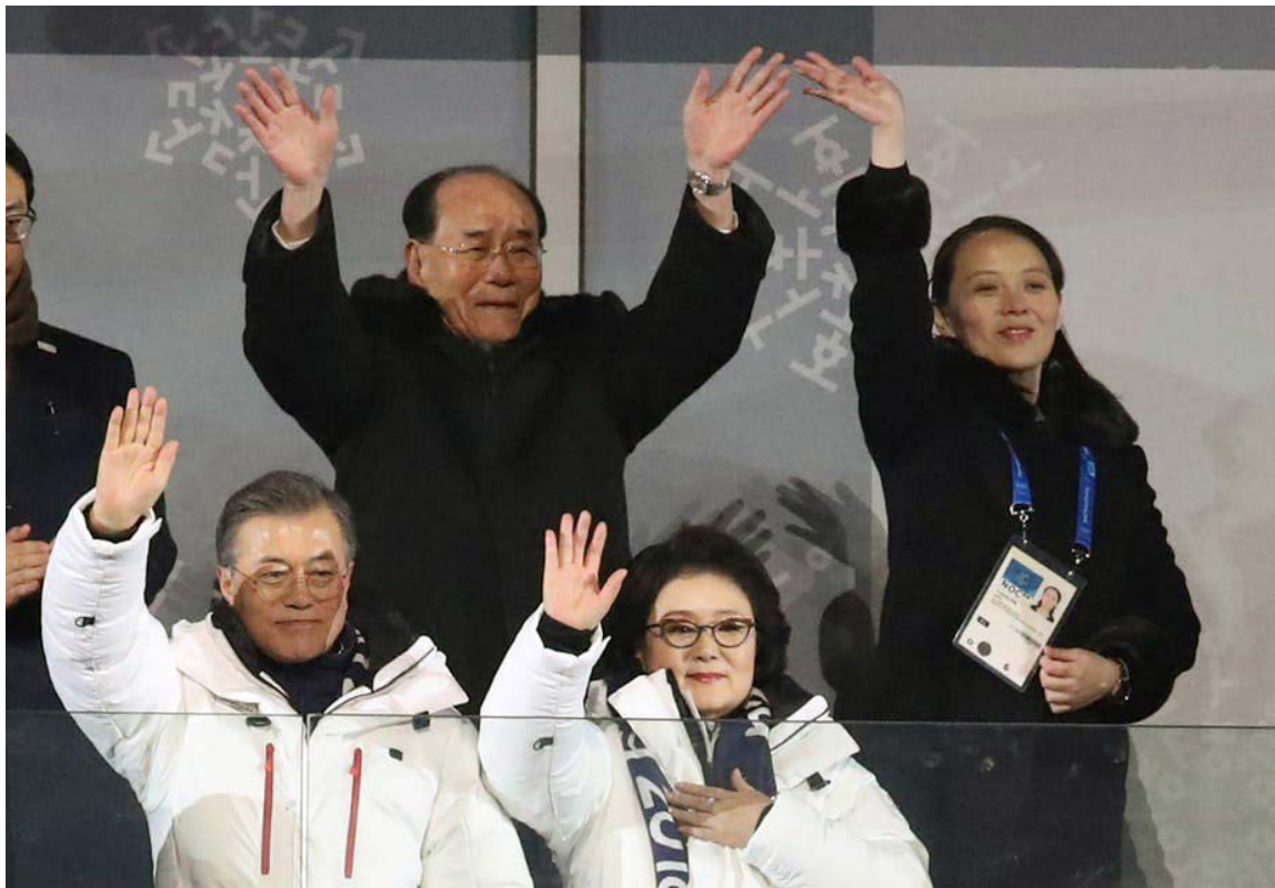
Come together: South Korea's president and first lady (front) with North Korea's head of state and Kim Jong-un's sister.