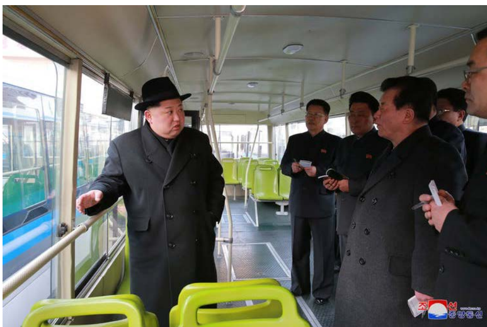
Kim Jong-un oversees a floundering economy.

Montville's analysis helps explain why Kim Jong-un might have chosen to use Track II outreach to an olive branch to South Korea, rather than resorting to formal Track I methods – and why he might have done so now.