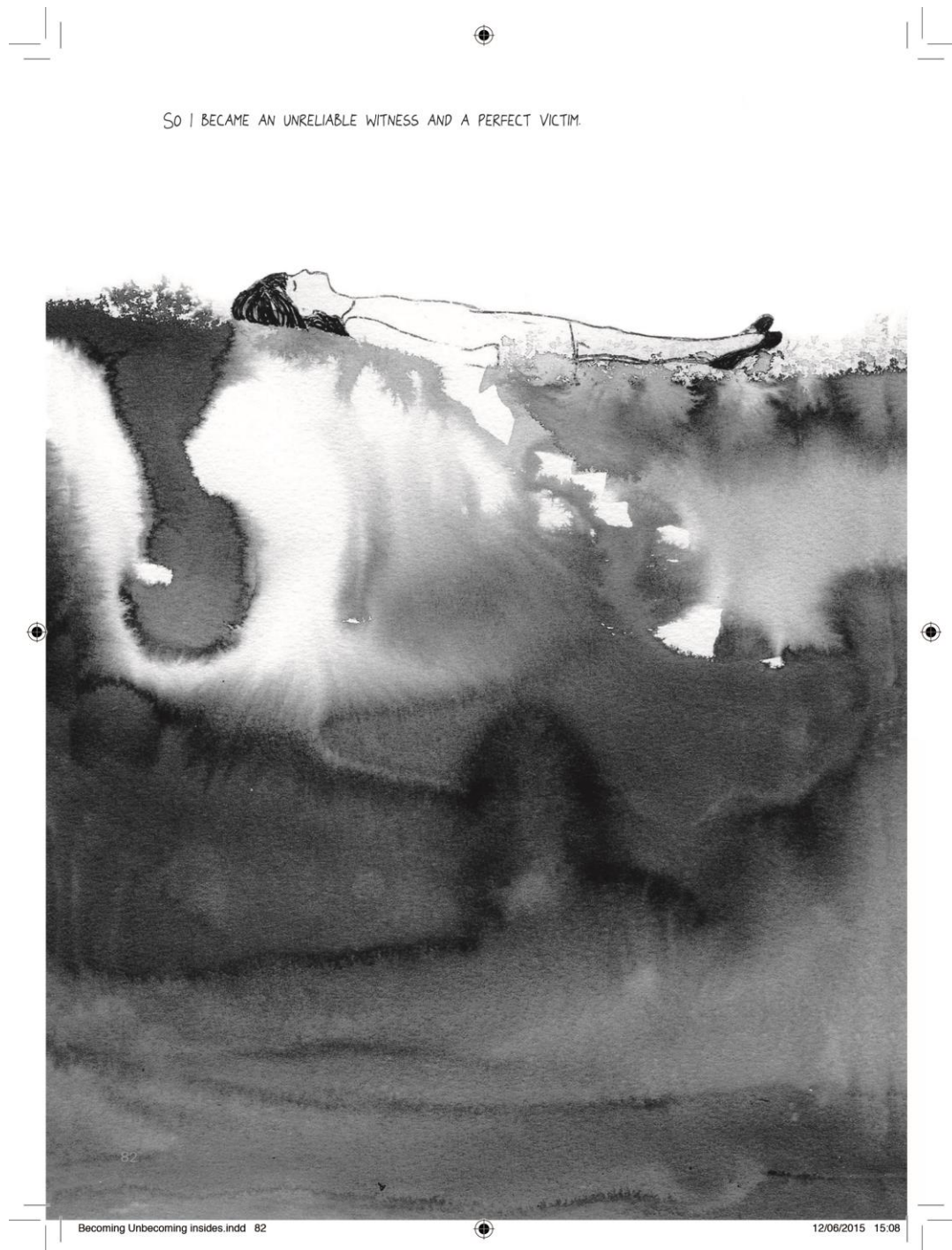
Figure 1: page 82

expectations concerning the sexual behaviour of girls, ultimately turn into a vast darkness into which she seems to be sinking. The surface on which she is lying dominates the page and her figure almost blends into darkness, illustrating her inability to detach herself from it.