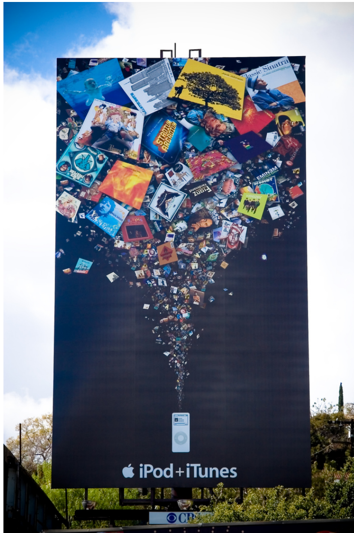
3. Music dematerialised. Apple billboard, 2005.

seeks 'the comfort of oblivion' (Ferguson, 2009: 165). As Peter Krapp (2004: xi) notes, while new media technologies make 'unprecedented forms of storage and access possible, the resulting mega-archive' may appear 'as the fulfilment of ancient fantasies of complete presence'. Indeed, as Jameson suggests, the phenomenological reduction to the present that characterizes much of contemporary life finds its only support in the notion of the eternal – to be out of time, in other