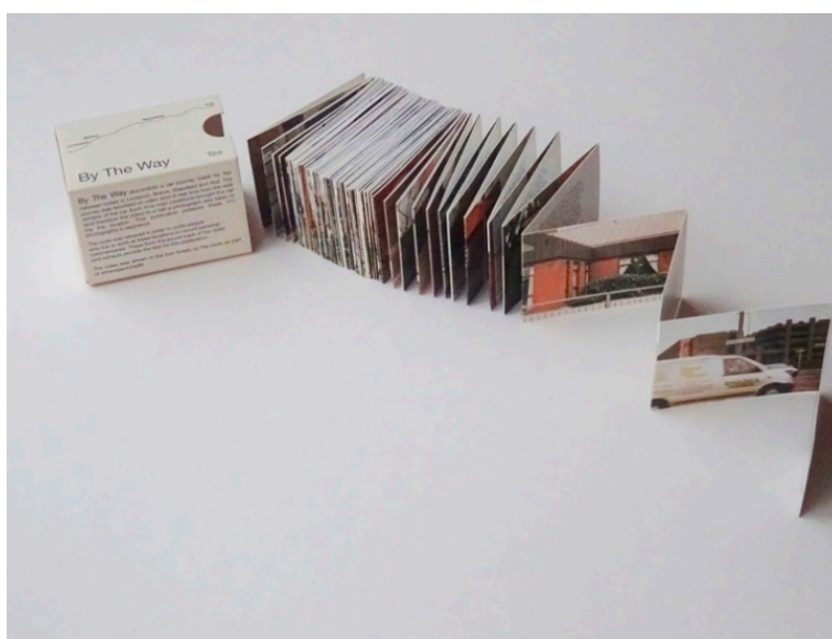
Figure 3. By The Way (1999) by Those Environmental Artists (TEA).

The deliberately awkwardly framed snaps taken out of a car side window are generally, but not exclusively, of architecture, the type you find adjacent to major trunk roads. With the artist's book, as opposed to the film, you can study each image for as long as you require, while having the opportunity to juxtaposition any of the other images next to it, even from opposite ends of the journey. Likewise, those texts can be read repeatedly, offering the prospect to digest their relevance to the places they depict. The publication By The Way (TEA 1999) was funded independently from artranspennine98 and seemed to fulfil a desire by TEA to produce a separate artwork that captured the essence of the work but in a material that is more durable than digital film. It is positioned against