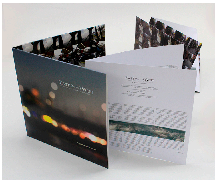
Figure 8. East {hyphen} West, Sound Impressions of Istanbul (2015) by Magda Stawarska-Beavan. Photo by Gavin Renshaw. Used with permission.

The inclusion of sound recordings within the books of Stawarska-Beavan, as well as those of artists such as Helen Cammock—whose artist book and record Moveable Bridge (2017) explores the effect of national politics and global economics upon communities in Hull—adds an additional dimension to the experience of place engendered by the work. Sound artists Agnus Carlyle and Cathy Lane describe how “the practice of listening can operate to reveal a parallel reality” to that of the purely visual, which “lies below, beyond, behind or inside that which is immediately accessible” (Carlyle and Lane 2013, p. 9). Stawarska-Beavan’s watery compositions, produced from recordings taken on, around and under the Bosphorus Strait, create a sense of movement, both physically and culturally, between the east and west of Istanbul. Yet, whilst certain distinctions emerge from the