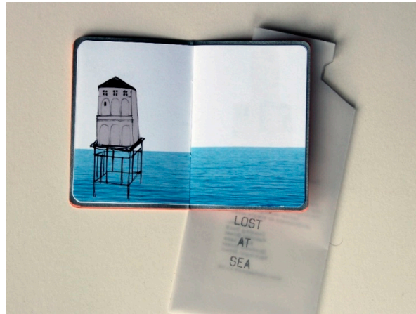
Figure 5. Lost at Sea (2009) by Emily Speed.

as a metaphor for “the empty space” left behind by the “disappearance of a loved one through dementia”, the act of unfolding also produces “an open plain full of possibility” (Speed 2019). As Gordon asserts, unfolding is not the same as falling apart, and the artist’s book suggests that hope and potential may be achieved through the dismantling of existing structures.