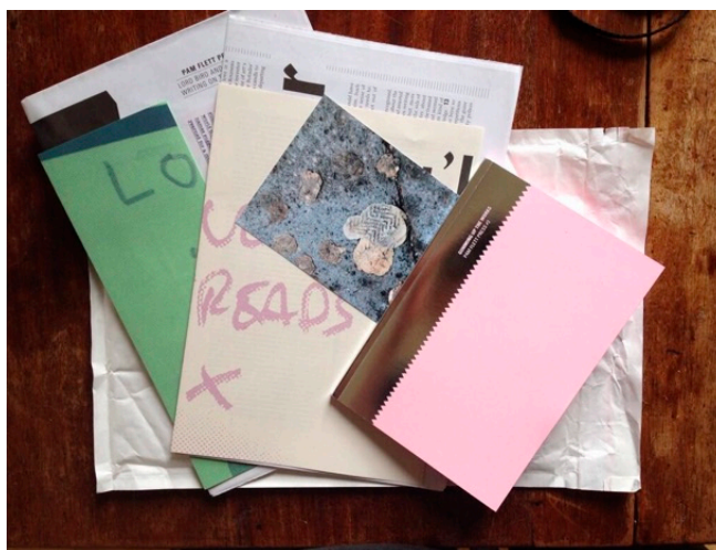
Figure 4. The Pam Flett Press by Joanne Lee. Used with permission.

Labours , 5 Twigs and Apples publishing 6 and The Shrieking Violet , 7 amongst many others, provide an antidote to what he sees as the mainstream co-option of radical art practices, through which “art activity is relegated to the blandness of footfall” in the service of financial gain (ibid., p. 54). Within the context of public art, the act of publishing can itself be thought of as “a public work” (ibid., p. 87), through which, as “a prime object”, the artist’s book occupies “if not sculptural, certainly critical space” (ibid., p. 70).