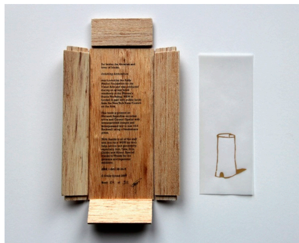
Figure 7. Unfolding Architecture case (2007) by Emily Speed. Photo by Elaine Speight. Used with permission.