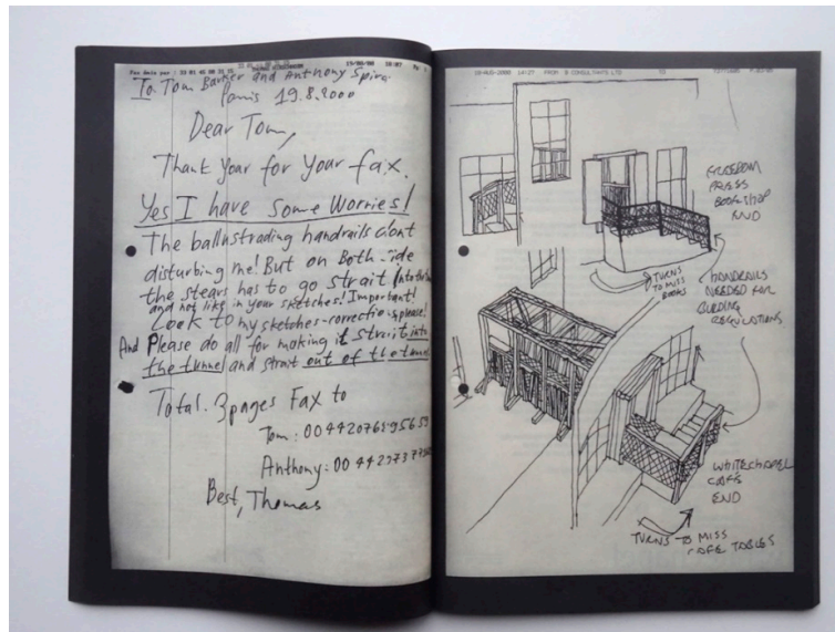
Figure 2. Material The Public Works—The Bridge 2000 (2001) by Thomas Hirschhorn.

It is a very open and honest record of the discords that are part of a work of this nature.