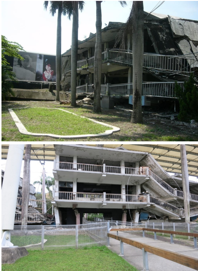
The grounds of the 921 Earthquake Museum (Public domain)

The museum's narrative focuses on science. Through interactive displays, the content is principally on the cause of the earthquake, rather than its course and consequences. Very little has been said on the response to the earthquake and even less on public perceptions of the museum. Remaining in situ not only continues collective mourning. It also serves as a powerful reminder of the strength and scale of natural disasters on the island. One major fact for this is that the quake occurred in the early hours of the morning and no one was in the school at the time. Had there been a loss of life – and in particular young life – I am not certain that the site would have been used in its current form. As it stands, it is representative of the 'natural' happenings as opposed to the 'unnatural'. The two earthquakes, although very different, have certain similarities, especially concerning response. Both focussed on changes to