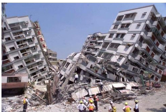
921 Earthquake, Dazhi (public domain)

On the former site of Guangfu Junior High School, which sits directly on the fault line, lies the 921 Earthquake Museum of Taiwan guoli ziran kexue bowuguan jiueryi dizhen jiaoyu yuanqu 國立自然科學博物館九二一地震教育園區. It opened on 13 February 2001 in remembrance of the victims who perished. The museum has five fine galleries: Chelungpu Fault Gallery, Earthquake Engineering Hall, Image Gallery, Disaster Prevention Hall and the Reconstruction Records Hall. But it is in the grounds of the building and the second and fifth halls that the museum serves as public history. 36 No attempt has been made to reconstruct the buildings – apart from securing them – or to clear debris following the initial quake.