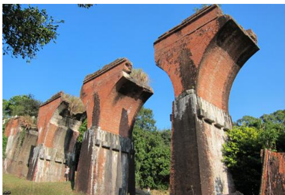
Longteng Bridge