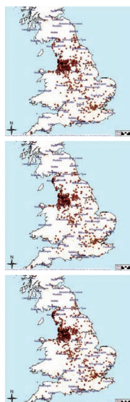
Figure 3. UK Recruitment Pattern 2006-2009

This study highlighted the fact that student mobility for UK students within the Faculty of Management at UCLan was proving to be a barrier to undertaking a placement. Many of the students were from the local area, a recruitment pattern that is increasing. Figure 3 below maps the recruitment pattern of UK students to the two schools over a three year period. Preston is in the centre of the highest density of dots.