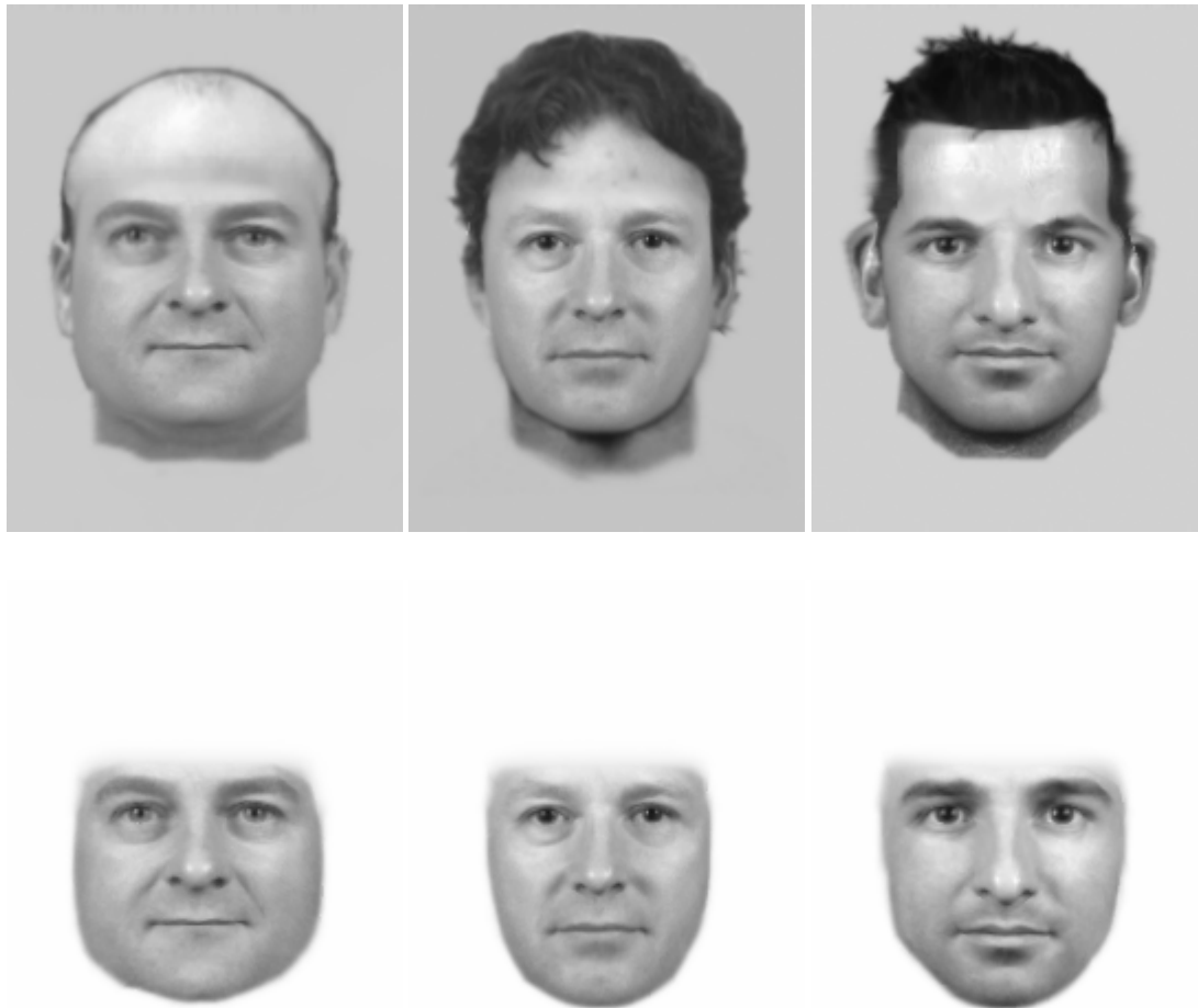
Figure 1. Example composites constructed in Experiment 1 by face-constructor participants using EvoFIT; along with 21 other composites, these images were given to further participants to name and rate for likeness. From left to right, they are of comedian Dara O'Brian (low-rated attractiveness category), actor Colin Firth (medium-) and singer/songwriter Peter Andre (high-). Naming involved complete composites (top row), as constructed by participants, and composites of internal features (bottom row).