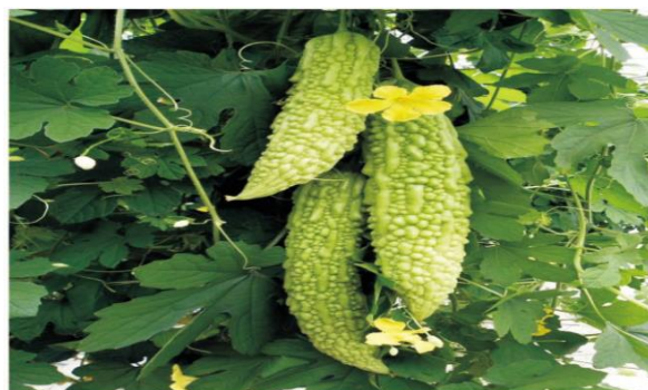
Figure 1. A photograph showing the bitter melon plant and its green fruits.

Herbs and other dietary supplements are used as complementary and alternative medicine either to avoid or to reduce the use of Western orthodox medical treatment. A recent study showed that up to 30% of diabetic patients use complementary and alternative medicines [6]. Since the ancient times, many plants and their extract were used as a treatment for numerous diseases, including diabetes. The WHO has listed 21,000 plants which are used for medicinal purposes around the world. Among them, 150 species are used commercially on a fairly large scale [7]. Bitter melon, which is also known as Momordica charantia ( M. charantia ), is a well-known plant used for treating and preventing diabetes amongst the populations of many tropical countries from Asia, South America, India, the Caribbean and East Africa [6]. M. charantia , is also rich in minerals, including potassium, calcium, zinc, magnesium, phosphorus and iron, and is a good source of dietary fiber and vitamins [8]. The medicinal value of bitter melon has been attributed to its high antioxidant properties due in part to phenols, flavonoids, isoflavones, terpenes, momordicine, anthroquinones and glucosinolates, all of which confer a bitter taste [9]. Figure 1 illustrates the bitter melon plant and its green fruits.