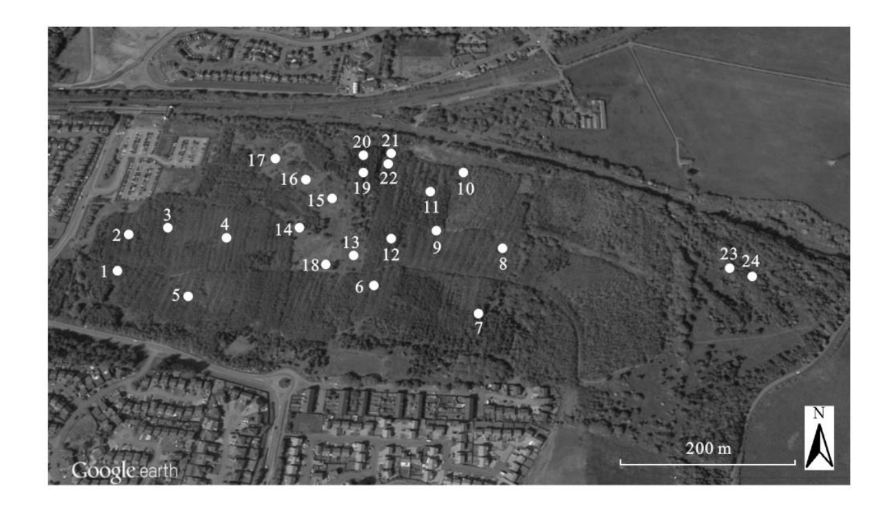
Fig. 1 Aerial view of the reclaimed Hallside steelworks in UK, bounded to the north by a railway and to other sides by roads. A total of 24 sampling points under different vegetation cover in 2018 are shown, with Nos. 1–12 under willow, Nos. 13–17 under grass, Nos. 18–19 under birch, No. 20 under Norway spruce, No. 21 under cherry, No. 22 under Scots pine, and Nos. 23–24 in unspoiled soils within an aspen plantation (control).