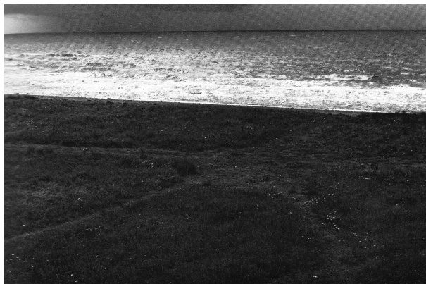
Fig. 6. Raymond Moore. “Maryport 1977.” (Edge).

It is worth noting some other apparent continuities between some of the later work of this period, and his earlier Pembrokeshire images. The visual elements of shore, water and horizon, for instance, are held in greater balance in an image like Maryport 1977 (Edge) (Figure 6) than in the earlier Pembrokeshire 1963 (Figure 5), of which it is reminiscent. In the latter picture, the sense of an absent human presence seems to be more foregrounded in what I earlier described as the signs of departure; the footprints left in the sand. Maryport