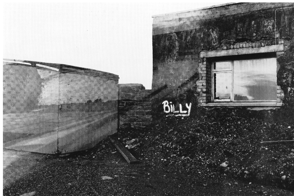
Fig. 4. Raymond Moore. “Maryport1977” (Billy).

Moore created many such compositions that could only have been realised with a small and portable camera, equipment whose deadpan precision and capacity for receiving whatever was in the gift of the light allowed him to fix fleeting objects in the field of vision. One might point to the scene captured in the photo that is titled, Maryport 1977 (Billy) (Figure 4). Here we are presented with what seems to be one image projected onto a hut-like structure that Moore has photographed (the structure on the left-hand side of the picture), but on closer examination it becomes clear that the reflection is in fact from another surface that comes between photographer, camera and the objects in the frame, but through which the objects are seen in a radically altered configuration. What we are looking at here could possibly be taken for a double exposure, but it is more likely an effect produced by the interior of a car windscreen. 14 In that regard, the photograph combines two perspectives: a reflection