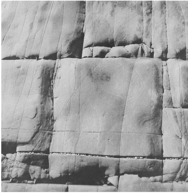
Fig. 1. Raymond Moore, "Pembrokeshire 1965" © The Estate of Raymond Moore.

their human creators. This kind of work, with its focus on the formal or physical qualities of objects helped to foster a philosophy that privileged the detailing of landscapes and commonplace objects in ways that only a machine like a camera could. Renger-Patzsch's aim was to picture his subjects "exactly as the camera saw them, devoid of any external elements that risked detracting from the 'being' of the object photographed." 6 "Photography," he wrote in 1929, "works faster, and with greater precision and greater objectivity than the hand of the artist." 7 It was something that Moore had quickly discovered himself and he would first be recognised for images of decaying surfaces taken at close quarters and landscape features whose surfaces registered change in the environment. 8