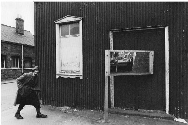
Fig. 3. Raymond Moore. "Reading 1973."

Are the figures in Reading 1973 (Figure 3), for instance — one positioned behind the photographer and one in front — looking at Moore as he points his camera, or at each other? There is no telling, although the reflected surface also works as a source of evidence for how easily perception can be disrupted by objects in the environment and — in the case of mirrors and other reflective surfaces — the ways in which they bring otherwise unnoticed particulars or phenomena into view. Mirrors, indeed, might be considered as the kind of objects that Graham Harman's Object-Oriented