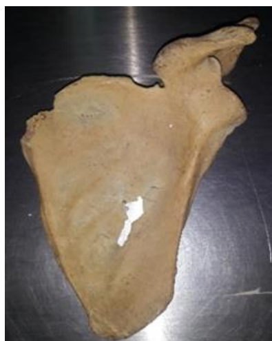
Figure 4: unusual morphology of the suprascapular notch; not fitting in either type of the rengachary classification system