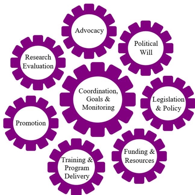
FIGURE 1 The BBF Gear Model details the BBF Gear Model, depicting how the gears are all interlinked and move one another to create a positive environment for change and one which is supportive of breastfeeding