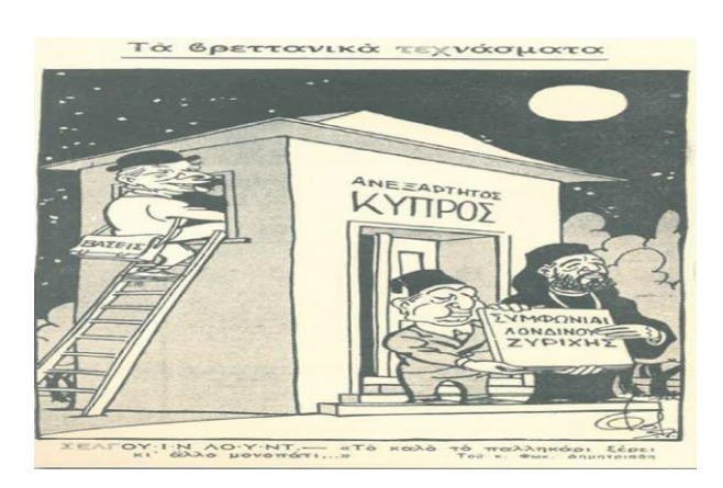
Figure 2: To Vima, 11 December 1960

Finally, it is worth noting that the general elections took place on 13 December 1959, while the negotiations that followed the Zurich-London Agreements continued until July 1960. During this 7-month period, important decisions about the future and administration of the SBA were taken. These focused on debates concerning the size of the Areas, <sup>121</sup> whether Appendix O would be legally binding, <sup>122</sup> and what would happen to the Areas if they were no longer needed by the UK. <sup>123</sup> So heated were the negotiations that in January 1960, the Undersecretary of State for the Colonies had to convene another conference in London between British, Greek, Turkish and Cypriot delegates in order to resolve their disagreements. <sup>124</sup> As late as April 1960, four months after the elections and 14 months after the signing of the Treaty of Establishment, the Undersecretary of State for the Colonies was instructed by Cabinet to 'have an informal meeting with Archbishop Makarios with a view to making it clear that, unless he accepted Dr Kutchuk's proposal [on the size of the SBA], we would break the discussions and seek some other settlement of the Cyprus problem in consultation with the Greek and Turkish