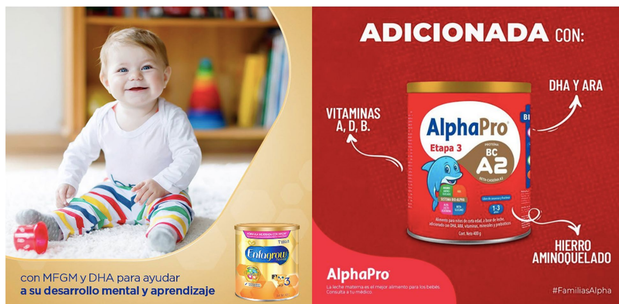
Fig. 2 Health and nutrition claims on a commercial milk formula in Mexico. Official webpages and social media of breastmilk substitutes companies in Mexico

smarter children-, -for healthier children-, -for children without colic-, all these allegations” (Interview 2, Civil Society Organization)