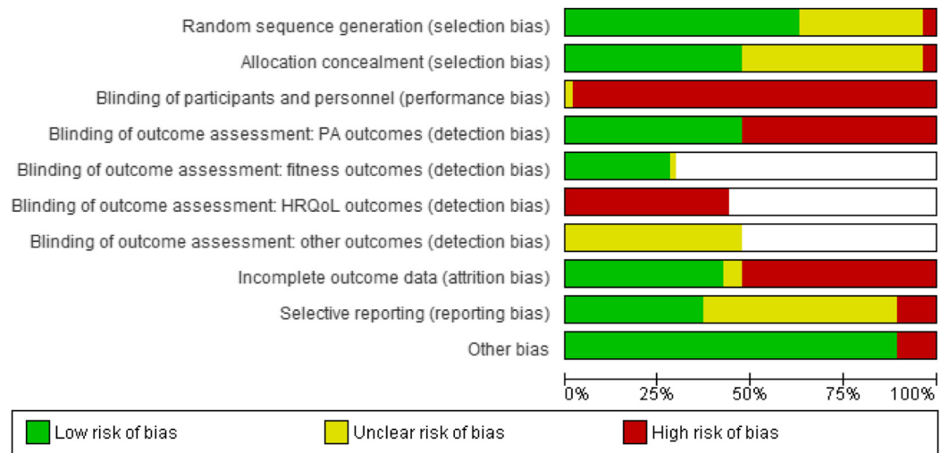
Fig. 2: Summary of risk of bias assessment across all included trials. Detection bias was judged at the outcome level and was not reported in all studies; therefore, percentages for these domains are not complete.

to combine data in analysis. The effects from most studies generally indicated little difference between intervention designs. One study 62 found improved engagement with PA after using a clinic-based intervention compared to a home-based intervention (RR 1.25, 95% CI 1.03–1.52; 57 participants; see supplementary file 14 ). For secondary outcomes, one study 66 found a small improvement in health-related quality of life with a home-based intervention compared to a clinic-based intervention (MD 0.32, 95% CI 0.27–0.37; 78 participants; see supplementary file 15 ), and another study 62 found improvement in pain with a home-based compared to a centre-based intervention (P value = 0.04; 57 participants; see supplementary file 16 ). But these findings were not comparable to other studies ( Table 6 ), and we judged all the evidence, which was sparse and generally inconclusive, to be very low certainty.