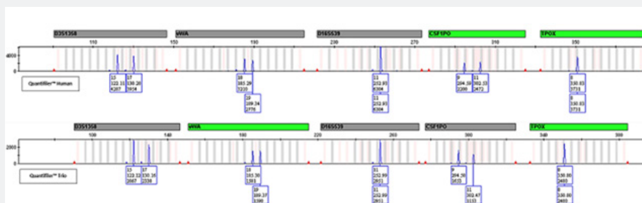
FIGURE 2: AN EXAMPLE OF THE ELECTROPHEROGRAMS OBTAINED BY THE QUANTIFILER™ HUMAN AND QUANTIFILER™ TRIO QUANTIFICATION KITS. THERE WAS A DIFFERENCE IN THE PEAK HEIGHT OF THE DNA PROFILES AT FIVE AUTOSOMAL STR LOCI (D3S1358, VWA, D16S539, CSF1PO, TPOX).

However, different volumes were required for one sample (circled in Figure 1), for which, 9.5 µL of the sample was diluted with 5.5 µL of molecular grade water for the Quantifiler™ Human kit and 8.6 µL of the sample was diluted with 6.4 µL of molecular grade water for the Quantifiler™ Trio kit. Full DNA profiles were obtained by both kits, but the peak heights (RFU) produced using the Quantifiler™ Human kit were relatively higher than the peaks obtained by the Quantifiler™ Trio kit (Figure 2). However, this small difference may be related to a human pipetting error or using an uncalibrated pipette, therefore establishing regular calibration protocols (e.g., every 3 months) or considering automated solutions to process samples for quantification can be beneficial.