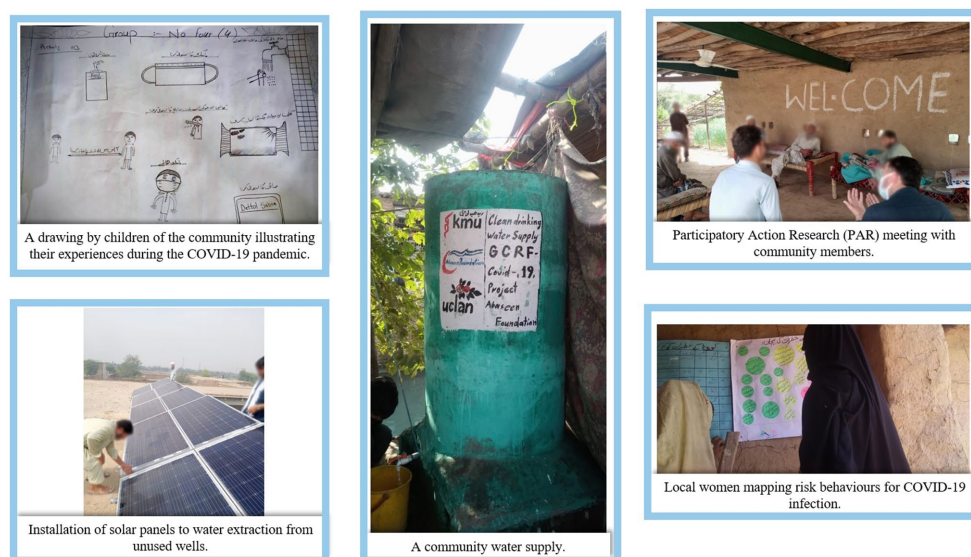
FIGURE 2 Photographs illustrating the different elements of the project.

reduce the spread of COVID-19 within their community; (2) Resource mobilization based on needs identified by the PAR members; (3) Delivery of safety messages through Community Health Champions (CHCs) and (4) Focus group discussions (FGDs) with the wider community to evaluate the impact of the initiative.