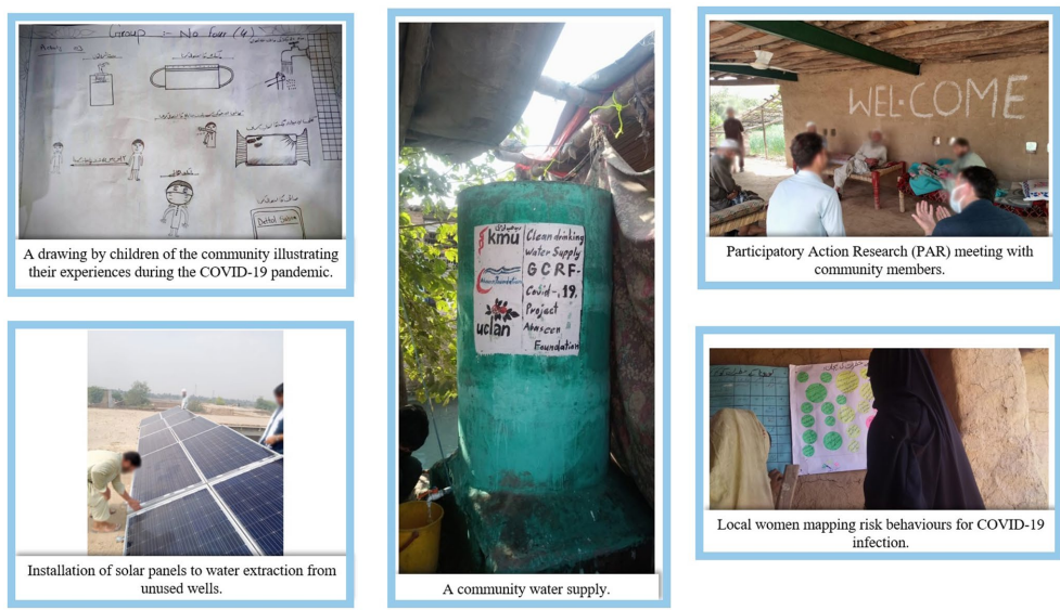
FIGURE 2 Photographs illustrating the different elements of the project.

reduce the spread of COVID-19 within their community; (2) Resource mobilization based on needs identified by the PAR members; (3) Delivery of safety messages through Community Health Champions (CHCs) and (4) Focus group discussions (FGDs) with the wider community to evaluate the impact of the initiative.