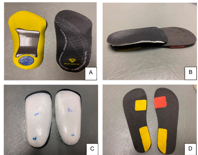
Fig. 1. Customized foot orthoses in the present study (A: PFO, B: completed CFO, C: inferior view of medial arch support, D: medial wedge).

Participants were provided with one pair of three-quarter length PFOs and CFOs by a physical therapist who had 7 years' experience of treating musculoskeletal problems using foot orthoses. The PFOs were made from a firm density polyethylene foam with a medial arch support and a gel heel cup (Sofsole Plantar fascia insole) and were sized according to foot length (Fig. 1A). The CFOs (Fig. 1B) included a medial-arch support made from thermoplastic material (Fig. 1C), with a corrective medial wedge of 3 mm using soft foam along the full length of the orthosis (Fig. 1D). The medial-arch support had a top leather layer of 1.2 mm and two layers of 1 mm polyvinyl chloride (PVC), which were