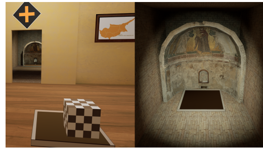
Figure 2: Inserting a resized cube into a trigger box unlocks a hidden room showcasing the famous 6th-century wall mosaic in Aggeloktisti.

The difficulty of the game is increased as the player progresses through the rooms. This is implemented by introducing new and combinations of challenges, riddles are harder to solve, challenges require multiple tasks to be completed, and less clues are provided to the players. The key game mechanics were developed by the second author of this paper as part of the requirements for his undergraduate degree final year project, under the supervision and guidance from the first author.