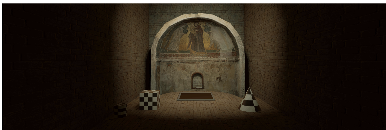
Figure 1: A view of a hidden room featuring the 6th century mosaic of Panayia Aggeloktisti church

1 School of Sciences, University of Central Lancashire, Cyprus