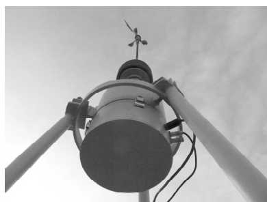
Fig. 3. The weatherproof camera housing and weather station installed at the top of the Monument