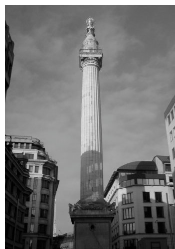
Fig. 2. The Monument of the Great Fire