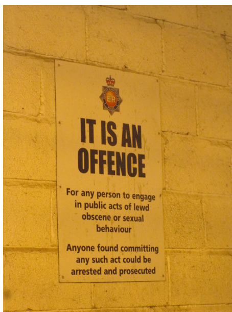
FIGURE 4 Notice in the Piccadilly Undercroft.