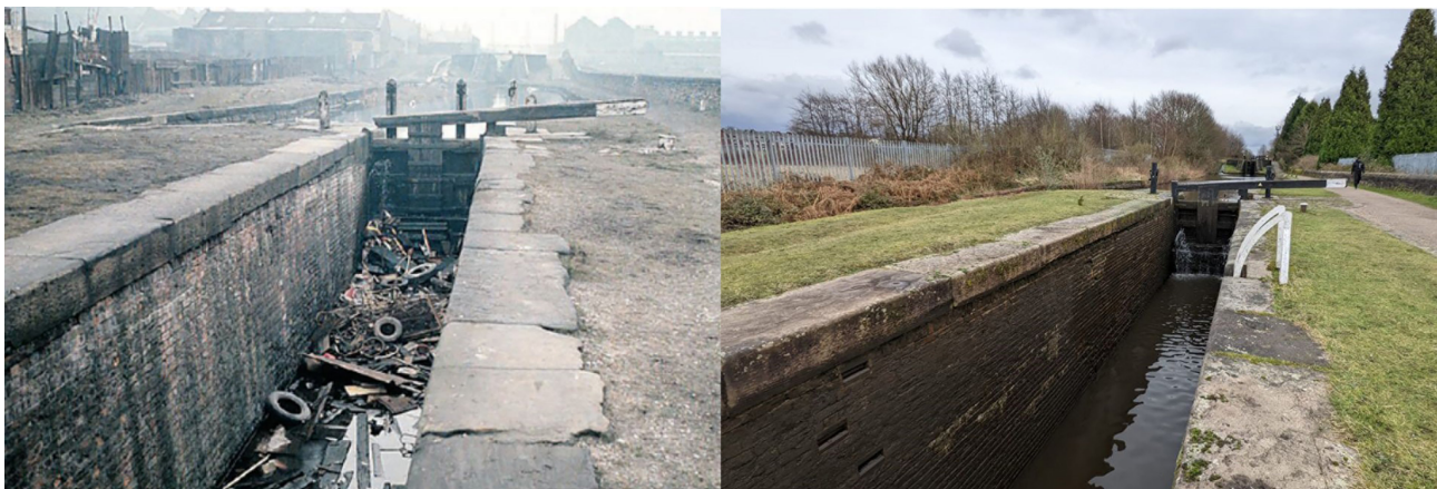
FIGURE 1 Ashton Canal lock 11 in the 1960s and in 2020s.

Since the 1970s, a renaissance of the UK canal network has taken place, which has further transformed urban canal spaces (Figure 1). This signifies a shift or flux in liminality. With canal restoration and a reduction in their pollution, initially through concerted volunteer-led campaigns (Trapp-Fallon, 2007) and then from the 1980s onwards an increasingly regulated focus on water quality, canals in UK cities now provide the ‘canvas’ for a refreshed configuration of liminal intersections—they have become transitional zones between the urban and rural, the ‘natural’ and ‘constructed’, and a routeway through which these differing environments can interact. Within modern UK towns and cities, canals can be a haven for wildlife, thereby bringing elements and ideas of the countryside into the urban environment, with the prices of canal-side properties reflecting this value uplift (Gibbons et al., 2021). Conversely, at the height of the Industrial Revolution, canals were the conduit through which the celebrated progress (and associated pollution) of urban industry radiated out into rural Britain.