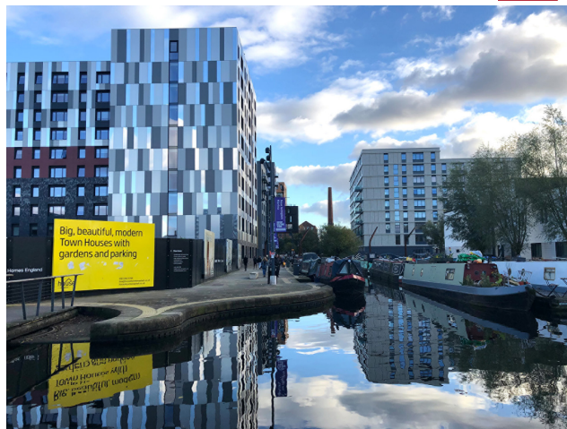
FIGURE 3 Canal waterfront development at New Islington, Manchester.