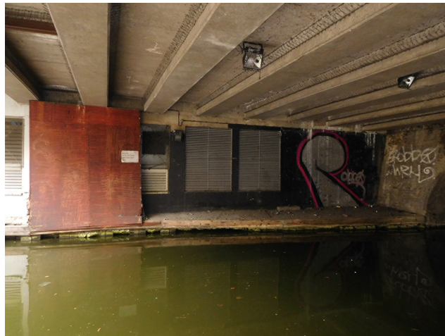
FIGURE 2 Tribute to Robbo underneath a bridge on the Regent's Canal in 2017.