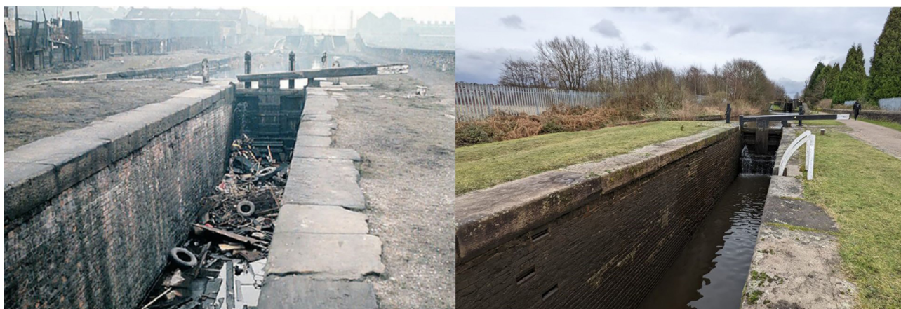
FIGURE 1 Ashton Canal lock 11 in the 1960s and in 2020s.

Since the 1970s, a renaissance of the UK canal network has taken place, which has further transformed urban canal spaces (Figure 1). This signifies a shift or flux in liminality. With canal restoration and a reduction in their pollution, initially through concerted volunteer-led campaigns (Trapp-Fallon, 2007) and then from the 1980s onwards an increasingly regulated focus on water quality, canals in UK cities now provide the ‘canvas’ for a refreshed configuration of liminal intersections—they have become transitional zones between the urban and rural, the ‘natural’ and ‘constructed’, and a routeway through which these differing environments can interact. Within modern UK towns and cities, canals can be a haven for wildlife, thereby bringing elements and ideas of the countryside into the urban environment, with the prices of canal-side properties reflecting this value uplift (Gibbons et al., 2021). Conversely, at the height of the Industrial Revolution, canals were the conduit through which the celebrated progress (and associated pollution) of urban industry radiated out into rural Britain.