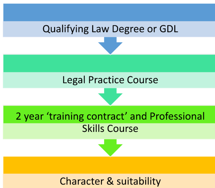
Figure 1: The route to qualification pre-SQE

The SQE was introduced in September 2021, and those commencing their Qualifying Law Degree or GDL after 31 December 2021 have no option but to follow the SQE route to qualification.