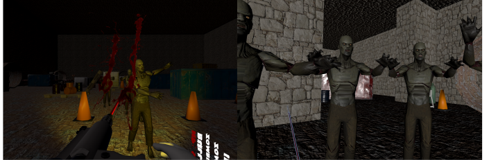
Fig. 1. Gameplay Screenshots.

players can strategically pause action around them while still maintaining control over their viewport, body movement, and aiming. Players are equipped with a shotgun and navigate a level populated with zombie enemies spawning and attacking in waves ("Fig. 1"). The objective is to eliminate all zombies and destroy their spawn areas. Notably, the shotgun is deliberately designed with decreased accuracy, a feature intended to discourage over-reliance on precision aiming, especially during the Time Dilation condition.