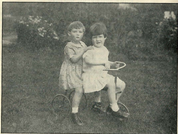
"A JOY RIDE"