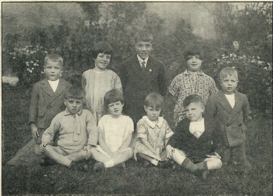
ADMISSIONS, YEAR ENDING SEPTEMBER, 1930.