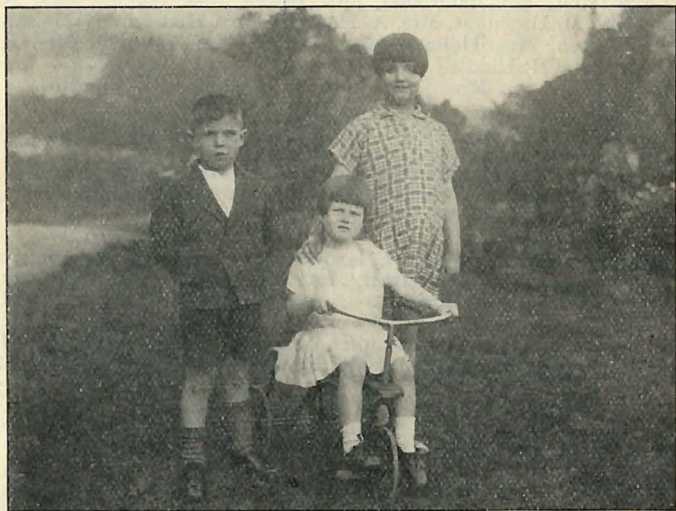
"SISTERS AND BROTHER"