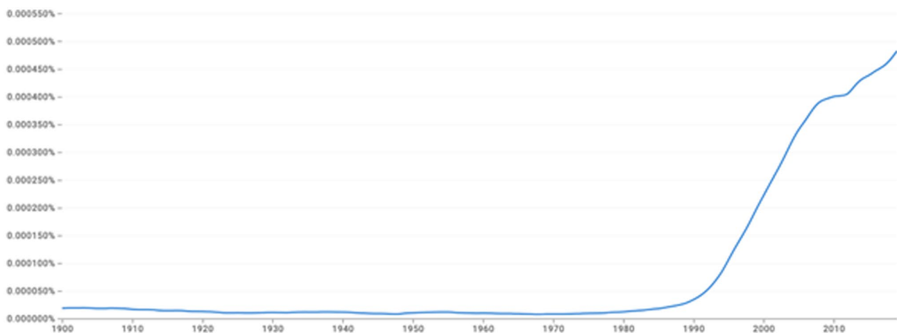
Fig. 1 Increased frequency in the use of the word stakeholder since 1990

In this context, it is worth examining the etymology of the word, and the power relations it has been used to indicate and reinforce. The word stakeholder derives from the word ‘stake’. The original meaning of ‘stake’ was a stick or post,