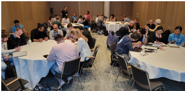
Figure 3: In-class experiment for this course at CHI 2023 in Hamburg.