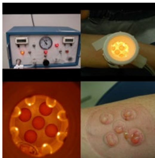
Figure 1: Epidermal suction blister grafting technique

Certainly, in recent years, various alternative techniques have emerged for obtaining suction blisters for grafting purposes. One such method involves a specialized Korean technique utilizing cups equipped with valves. This innovative approach offers an alternative way to induce blister formation for graft harvesting in dermato-surgical procedures. Moreover, modified procedures utilizing syringes have been developed, including those integrating a three-way tap system. These adaptations aim to improve blister formation techniques, potentially addressing drawbacks associated with incomplete blister development and time consumption. Such advancements in technique and equipment provide alternative options for effective blister induction in suction blister grafting procedures, enhancing the