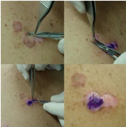
Figure 2: Epidermal Suction blister grafting technique donor site