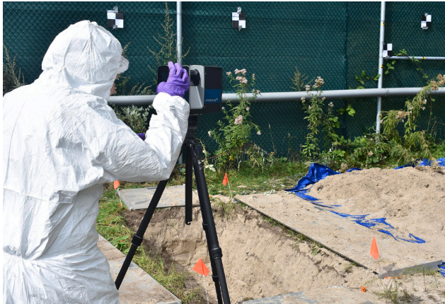
Fig. 4. Snapshot of Geo-imaging protocol (Netherlands Forensic Institute).