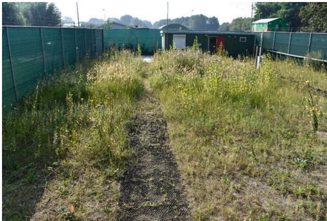
Fig. 1. Image of ARISTA Facility (two weeks before working group donor placement).

hosted by the facility partner (Amsterdam Medical Centre, AMC), which instigated whole group discussions and identification of potential research projects involving human subjects and human tissues for forensic, policing, and biological scientific studies. To maximise the data gathered from the donors, it was deemed essential to work in a way that did not adversely affect the validity of each researcher's work. The value of this multi-disciplinary approach to research was not underestimated, as the aim was to provide the baseline data and ethical working structure for the successful development of a future UK HTF. The UK-Netherlands Decomposition Experimental Research (UNDER) group was therefore founded to realise this vision.