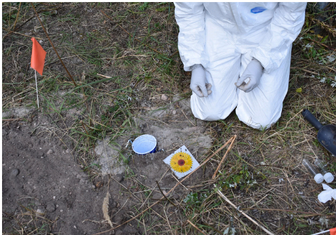
Fig. 5. Snapshot of Entomology protocol (University of Portsmouth).