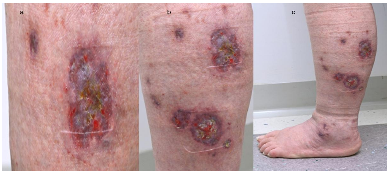
Figure 1: (a) Purple ulcers in a close up on the left leg; (b) Non healing ulcers as well as scarring of the previous healed ulcers on the left leg; (c) Shows close-up view of violaceous to purplish ulcers on left leg along with hyperpigmented scarring seen both on left leg and foot.

Patient couldn't tolerate pentoxifylline and was switched to one of the direct oral anticoagulants (DOACs) instead. Leg ulcers were treated with topical emollients and dressing, with compression stocking. With this management, it took months to achieve remission in this case.