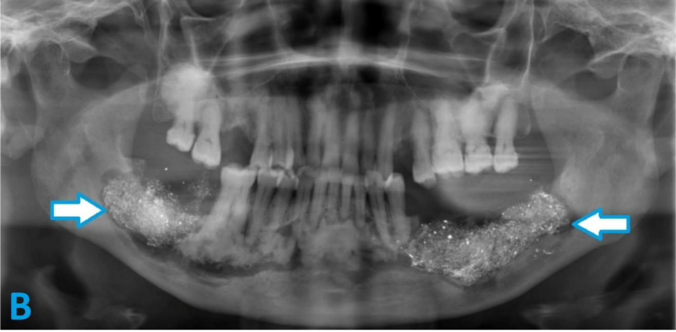
Fig. 3 (a) Pre-operative panoramic radiograph of a patient with extensive florid COD and features of osteomyelitis in the mandible bilaterally. (b) Post-operative panoramic radiograph of the same patient post debridement of COD and placement of BIPP impregnated gauze