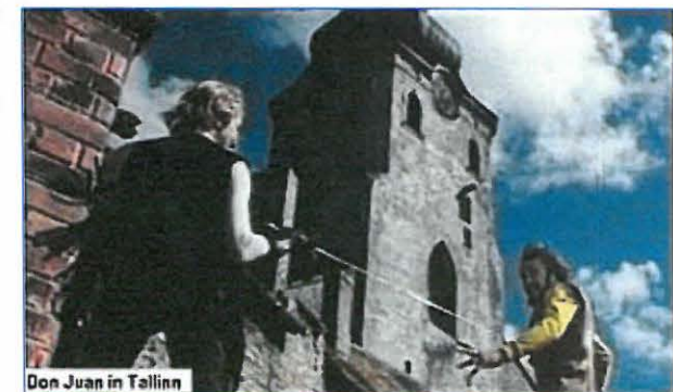
Don Juan in Tallinn