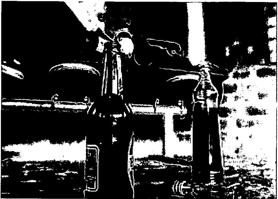
“Binge drinking’ killed barman”, (Daily Express, 2008).