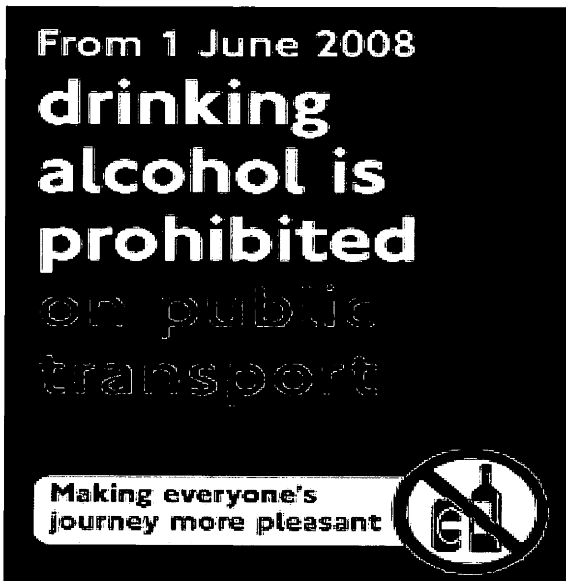
“Johnson bans drink on transport” (BBC News, 2008b)