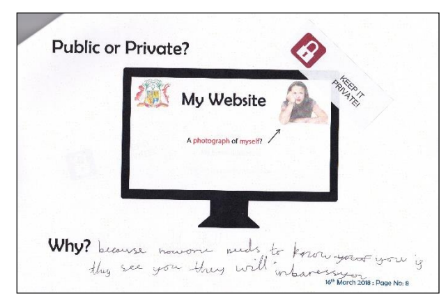
Figure 2: One of the survey question pages

and the participants were asked to tell Opaline if she should make several scenarios public or private. Underneath each question was a space for the child to write down the reason why they chose that option (see figure 2). The survey questions were designed not to ask the participants outright questions to try and encourage truthful answers and mitigate against satisficing. Instead, the children were provided with a set of sticker books that they could use to answer the questions.