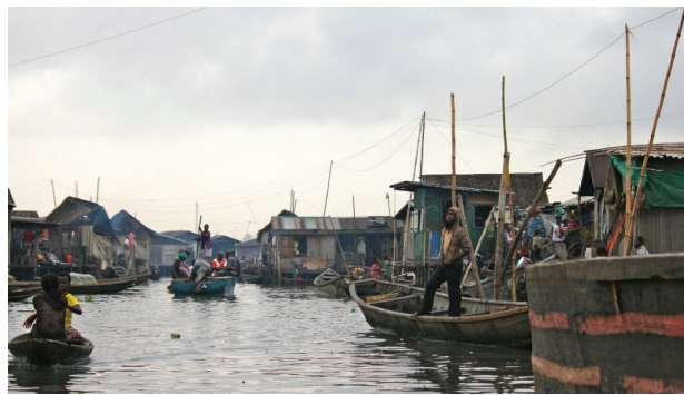
Figure 3. Makoko, a slum with part of its community built on stilts along the Lagos lagoon.

With increased and ongoing influx of people into the cities, there is a consequent increase in household waste. Most landfills, which are not located within the urban core but in and around the squatter settlements, are completely full and overflowing to the surrounding areas with open decomposition of wastes. This leads to the outbreaks of diseases, festered by insects and rodents like houseflies, rats, and cockroaches, which in turn take a negative toll on the swamp dwellers. In addition, there are inadequate sewage facilities in areas of unchecked rapid growth of slums and squatter settlements which are unlawfully developed by the urban