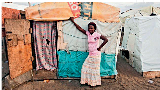
Figure 4. A slum in central Lagos.