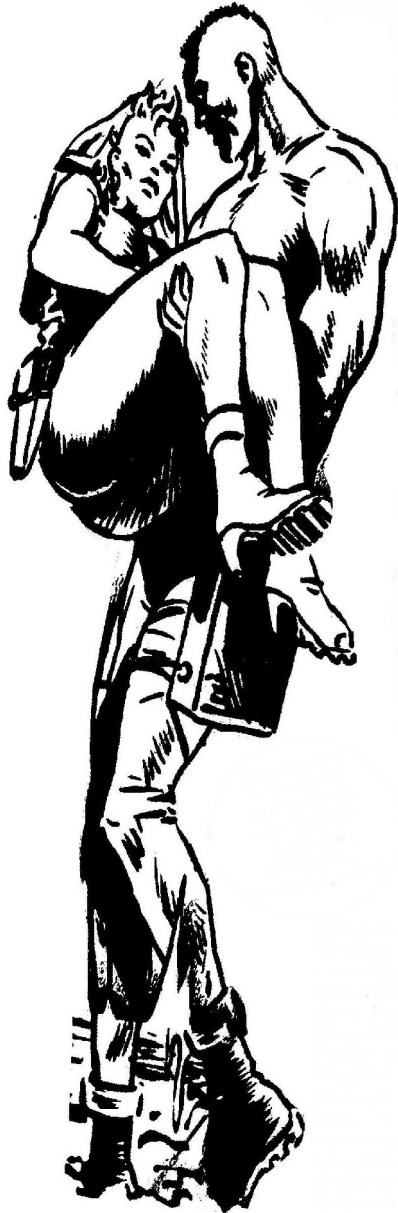
Guy Gorilla Your Role Model