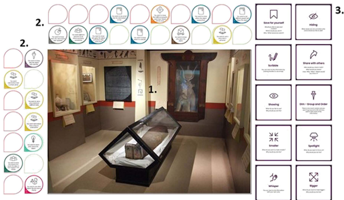
FIGURE 3. The Board. Alt Text: An example of the board with the scene at the centre. To the left and above value cards in both active and inactive slots and to the right the interaction cards.