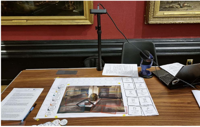
FIGURE 6. Study set up. Alt Text: A photograph of a table in a museum showing the board with the values and interaction cards ready to be used. There is a webcam pointed down at the board with a microphone to the side.

and interactions. Other materials used by the research team for evaluation purposes included: a Logitech pro personal video camera to record video footage in 1080p, an external Logitech Yeti microphone to capture the think-aloud audio from participants and reduce background noise, Open Broadcast Software (OBS) to capture the recording in preparation for analysis and notebook for researcher observations.