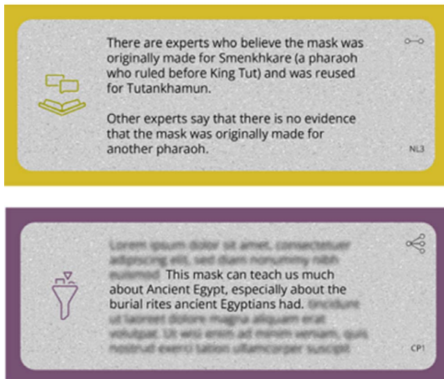
FIGURE 1. Sample of contextualised cards relating to the associated values used in the design method. Alt Text: Two example cards demonstrating contextualized information in an ideation method. One card is clear, while the other has blurred text to simulate partial information.