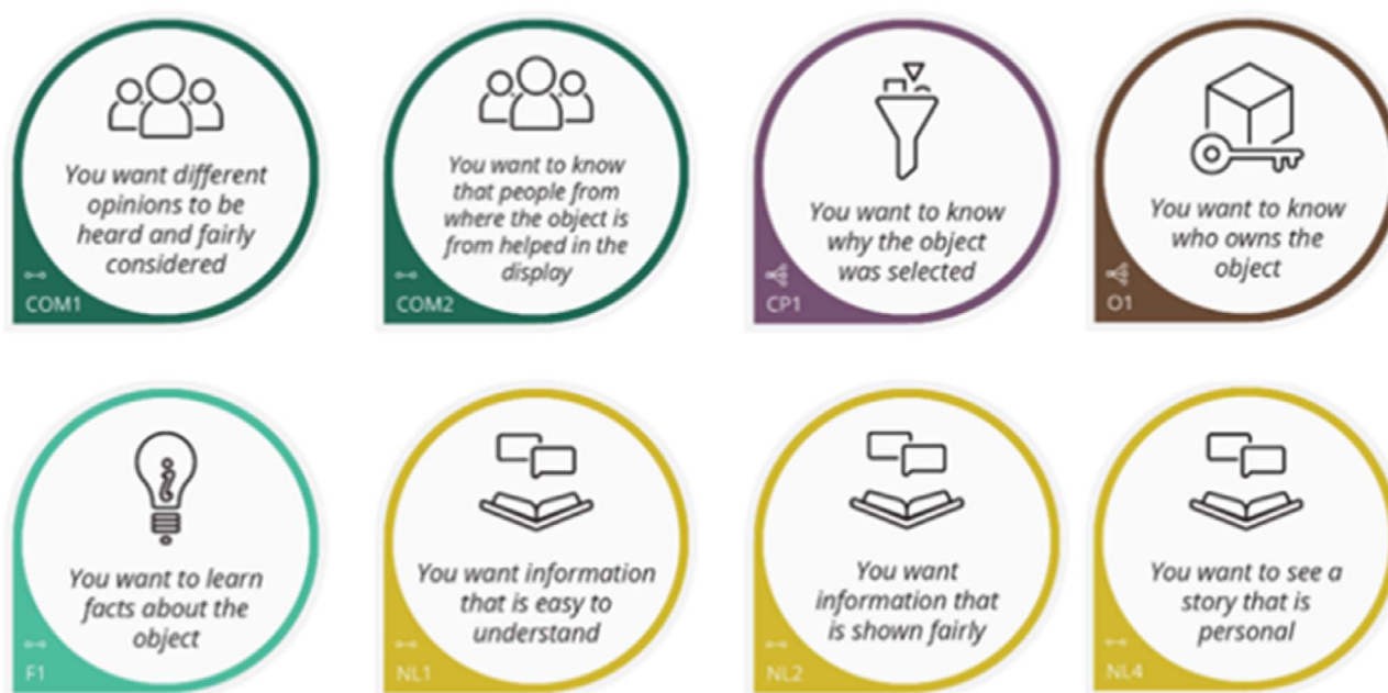
FIGURE 4. Sample of design values depicting the label, graphic, iconography, and identification number. Alt Text: Eight value cards arranged in two rows. Different Icons and text is present on the cards.

1. Design value cards suitable for the context of work—check with child experts as to the way they should be described/depicted—make value cards 2. Design and make Interaction cards suitable for the context 3. Choose a focus for study, design the board scene and build the board, build the Contextualisation cards, design the Value laden narrative 4. Pilot (in our own case), when piloting the study two important things were found—the first was that the 17 value cards we had chosen were found to be too many and were overwhelming and so we chose to limit the number of active cards in each session to just seven—this avoided